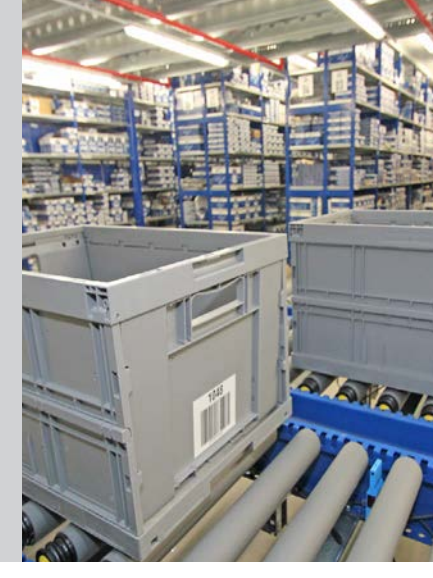
Integrated conveyor systems for smooth operations

A special area is reserved for in-house production, where employees assemble special repair kits. The required components are supplied from the high rack warehouse (HRW) and the small parts warehouse (SPW) as well