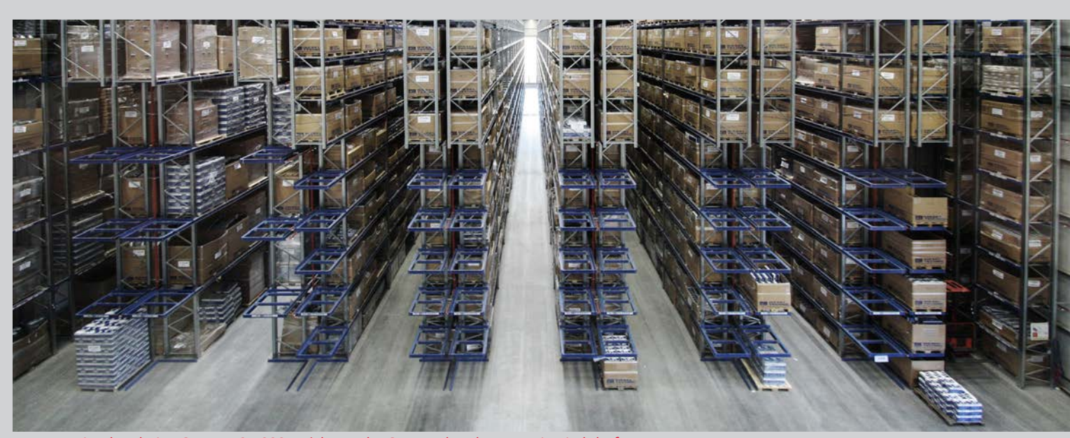
Diesel Technic AG stores 25.000 articles at the German headquarters in Kirchdorf