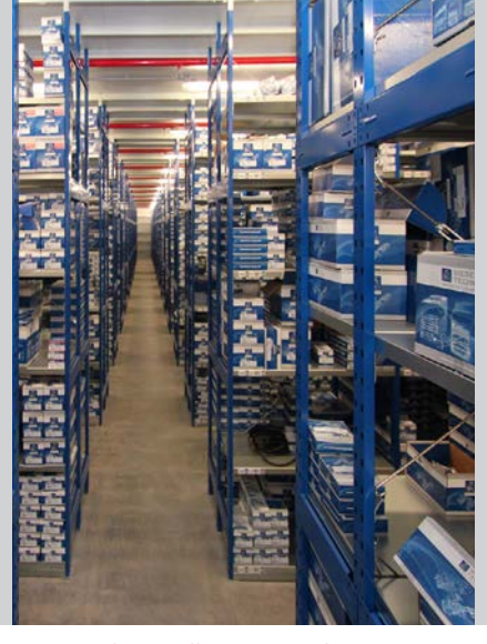
View at the small parts warehouse

The initial operation of the real system was launched after a 12 month development and deployment period. Just over two years later, the logistics center was extended through the integration of a new narrow-aisle high rack warehouse and a small parts warehouse.