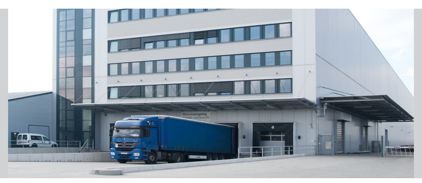
Worldwide spare parts supply from our headquarters in Kirchdorf

Parallel to this, the dynamic storing of the goods according to the ABC classification is supported though targeted strategies to ensure the best possible allocation in the high rack warehouse and the small parts warehouse.